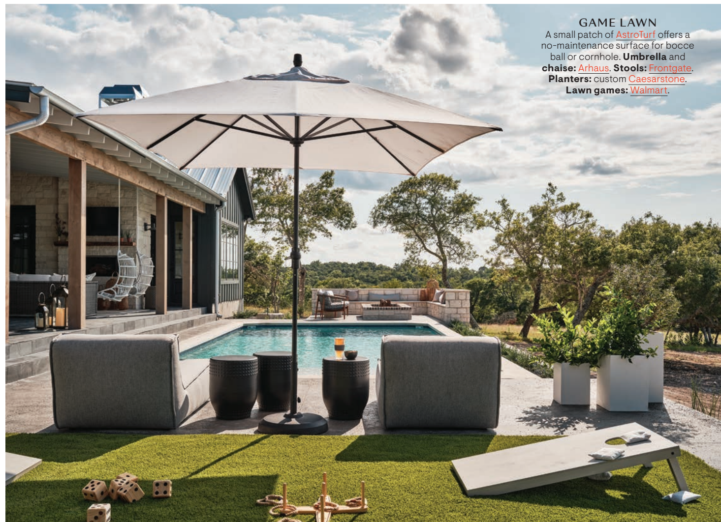
GAME LAWN A small patch of AstroTurf offers a no-maintenance surface for bocce ball or cornhole. Umbrella and chaise: Arhaus . Stools: Frontgate . Planters: custom Caesarstone . Lawn games: Walmart .