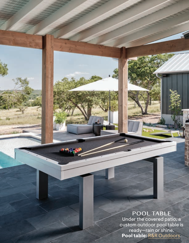
POOL TABLE Under the covered patio, a custom outdoor pool table is ready—rain or shine. Pool table: R&R Outdoors .