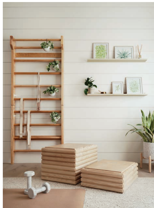
HOME GYM This solid pine piece is part suspension trainer, part plant holder, while the top of the custom desk can be removed to create aerobic modular steps. Shelves: Shelfology. Shelf art: Maddie Moritz. Desk "steps": Grothouse.