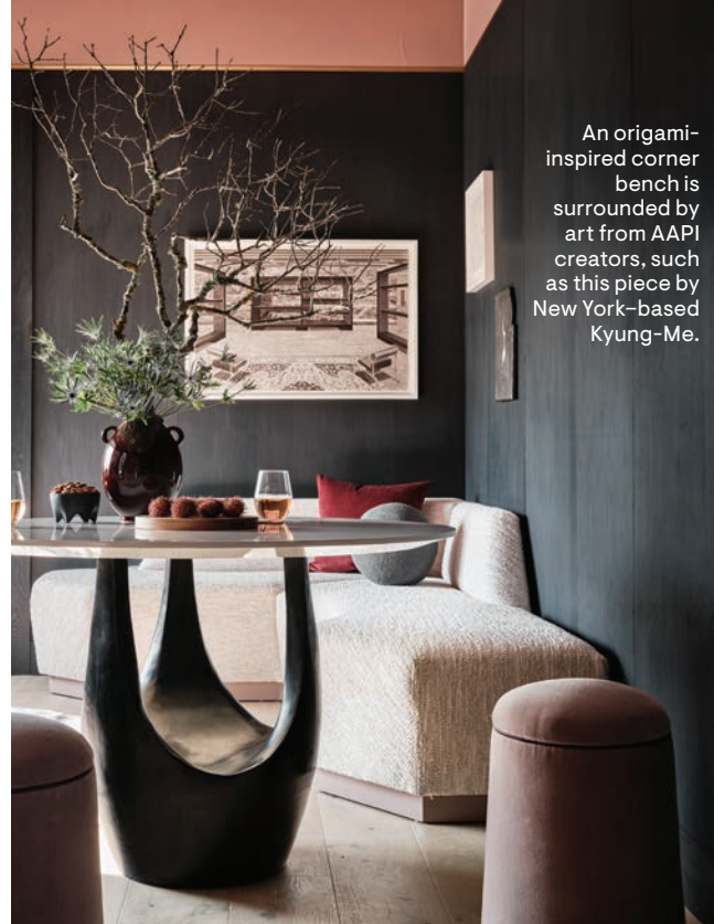
An origami-inspired corner bench is surrounded by art from AAPI creators, such as this piece by New York-based Kyung-Me.