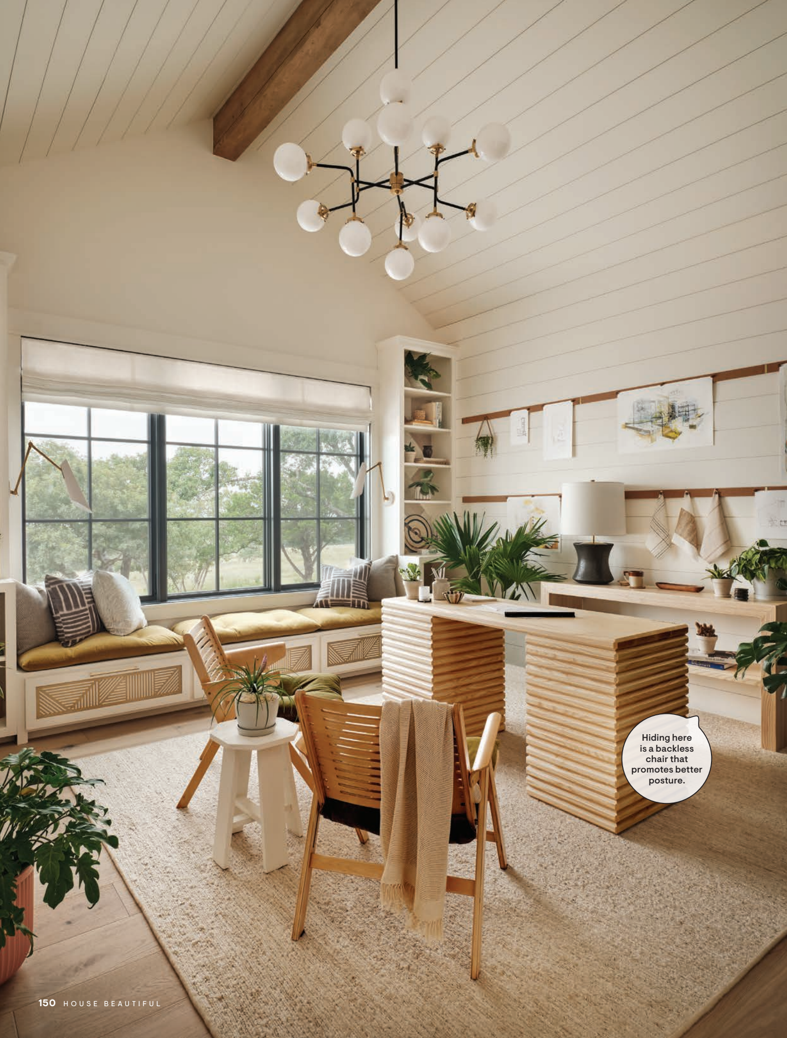
WINDOW SEAT Fresh white walls and simple upholstered cushions frame the greenery outside. Bookcase wallcovering: Phillip Jeffries. Metal cabinet fronts: Architectural Grille. Pillow and cushion fabric: Fabricut. Window treatments: The Shade Store.