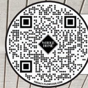
WATCH IT ALL GO DOWN Tune in to Blank Slate , our new nine-part video series, to see how every single room in this house took shape. housebeautiful.com/whole-home-2021