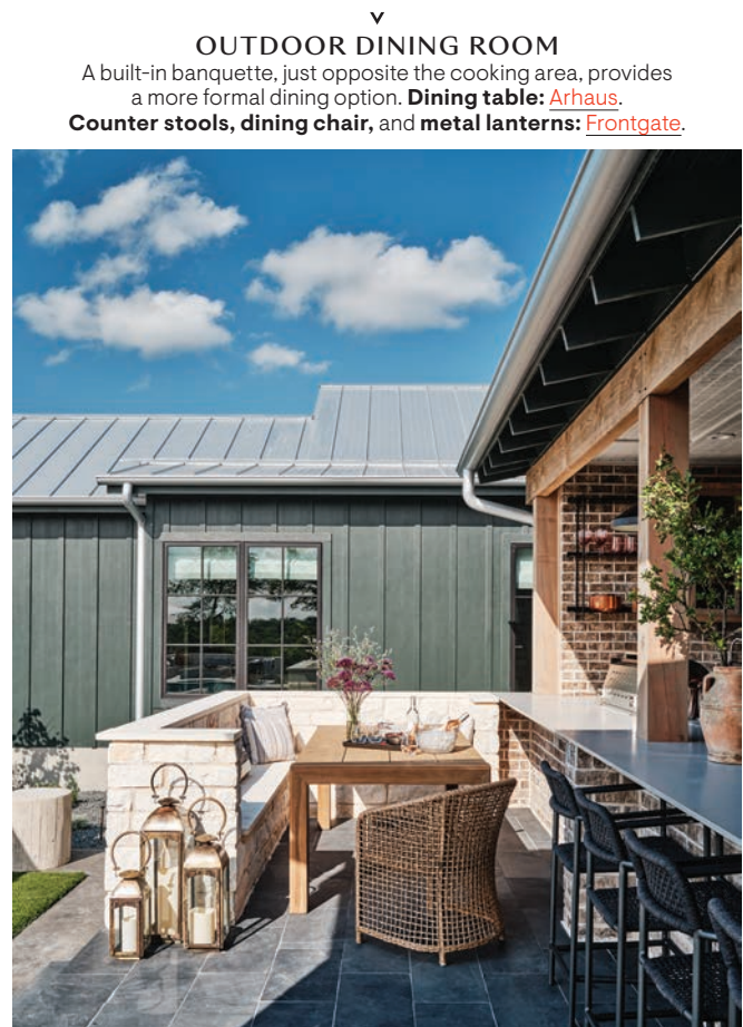
OUTDOOR DINING ROOM A built-in banquette, just opposite the cooking area, provides a more formal dining option. Dining table: Arhaus . Counter stools, dining chair, and metal lanterns: Frontgate .