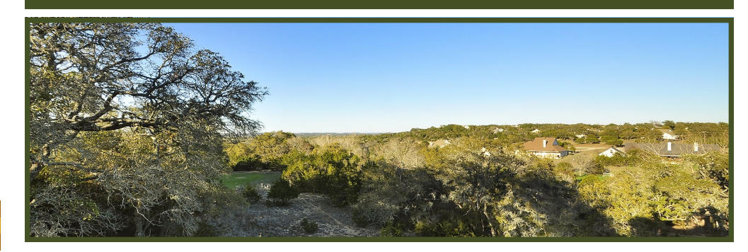
All information contained herein deemed reliable but not guaranteed.

Great floor plan with large walk in closets for all bedrooms, 2 bedrooms down, and an oversized 2 car garage. Master boasts luxury with coffered ceiling, 5" wood floors, and a huge bath with coffee bar, whirlpool tub, and HUGE walk in closet!